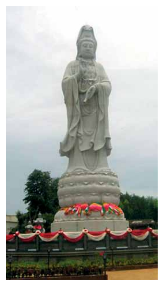
Figure 8. Kuan Yin overlooking the bridge

grand floating restaurant serving hundreds of customers. The visual perception of the scene has totally changed. The historic connection between the bridge and its landscape has been destroyed.