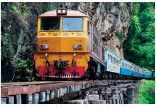
Figure 10. Tourist train on re-laid track

A ride along the railway in a vintage train is perhaps the most authentic experience on offer at the site. The train passes along the track of the original railway, through landscape which is largely unchanged beyond the urban limits. There is no commodification of the war story involved, just an experience of the train and the landscape. Since the train is also a regular service for local transport, tourists experiencing the "Death Railway"