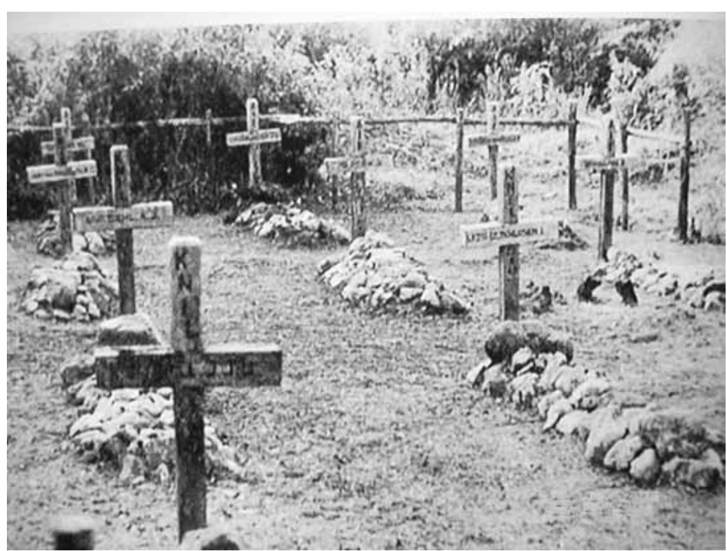
Figure 4. Temporary burial ground by the railway during construction

most prominent sites of atrocity heritage tourism are associated with the Second World War. They include former concentration camps in Germany and the Atomic Bomb Dome and Peace Park in Hiroshima, the target of the atomic bomb dropped on 6 August 1948. The Dome was part of a major exhibition hall which was hit directly by the bomb. The Japanese government decided to leave the remaining steel frame of the building as a memorial that visually recalled a human skeleton. Around this focus, the government built a memorial garden as a peaceful area where survivors, the bereaved, the concerned and the curious could visit to reflect on the event.