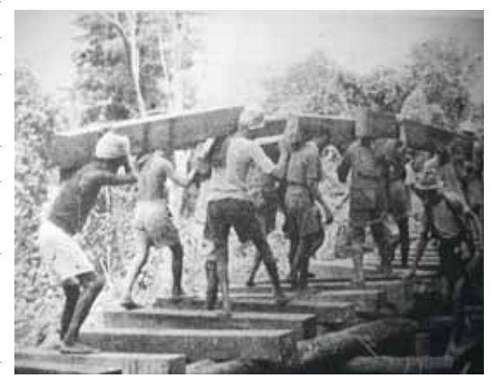
(Australian War Memorial)

also used for local transportation, the line became a tourist attraction known as the "Death Railway". On weekdays there are two trains mostly used by local people while at weekends extra services are added to meet tourist demand