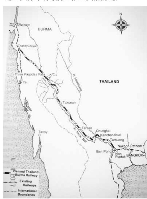
Figure 1. Map of the railway

In December 1941, Japan launched its attack against the western Allies in Asia. After Japanese troops landed on the Thai coast, the Thai government agreed to allow them passage to invade the British colonies of Malaya and Singapore, and later issued a declaration of war on the Japanese side. The Japanese Imperial Army demanded Thai assistance for the construction of a railway into Burma. Capturing Burma was important to Japan for three reasons: to cut the "Burma Road", the 720-kilometer Lashio-Kunming highway that was the only route for the western Allies to transport military supplies to China; to secure raw materials required by Japanese industry such as wolfram from the Mawchi mines and oil from the Yenangyuang oil fields; and to establish a supply line through Burma to India to replace the sea routes vulnerable to submarine attacks.