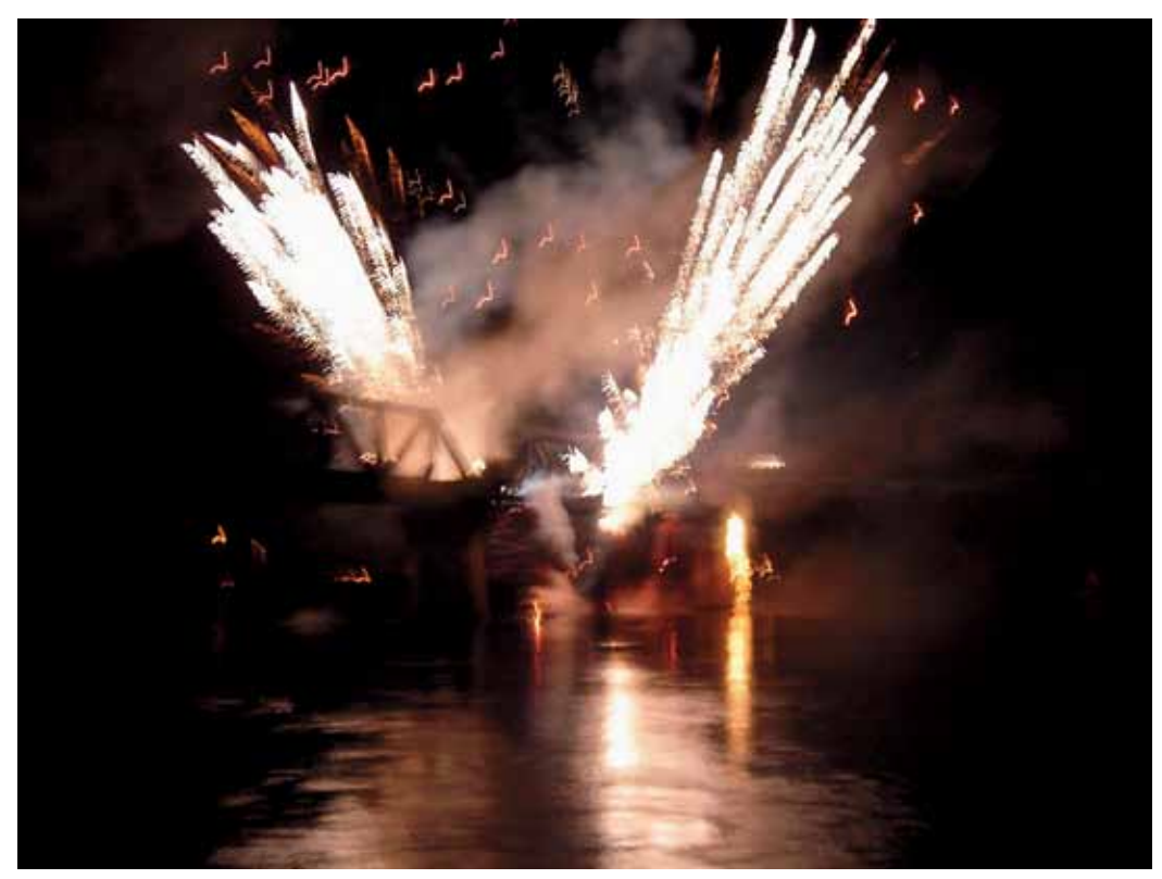
Figure 9. Light and sound show of bombing the bridge

APINYA BAGGELAAR ARRUNNAPAPORN ATROCITY HERITAGE TOURISM AT THE "DEATH RAILWAY" 267